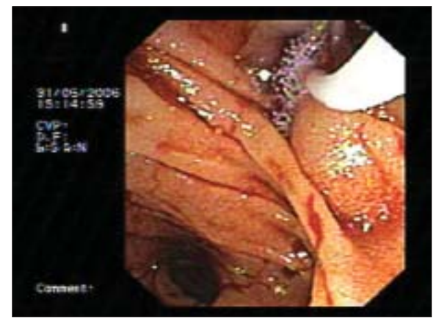
Figura 2 - Obliteration of the varix with injection of N-butyl-2-cyanoacrylate.